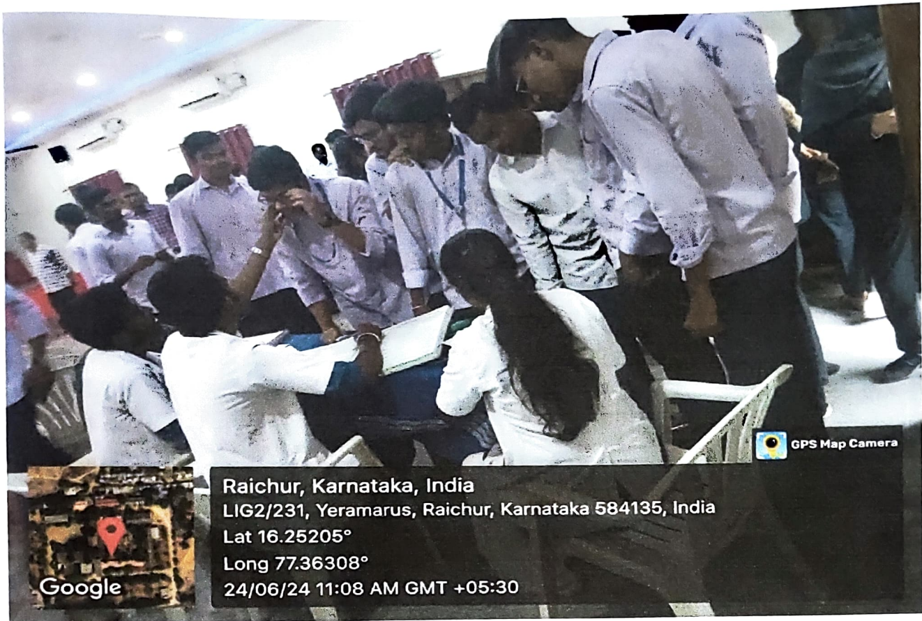
Preliminary Tests conducted at registration desk by medical officers